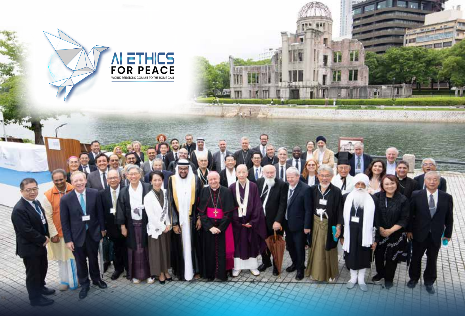
Hiroshima, Japan - July 10th, 2024. Participants to the event "AI Ethics for Peace: World Religions commit to the Rome Call" gathered for a group photo.